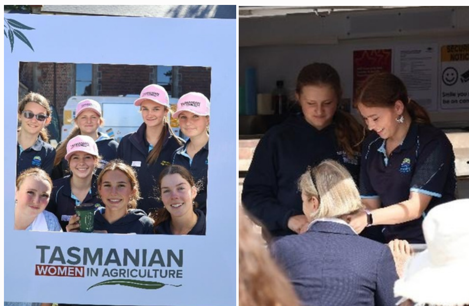
Photos show Deloraine High School students participating in the Launch Pad program at Gathering 2026.

We extend our sincere thanks to everyone involved in making the day such a success. We look forward to being involved again in the future.