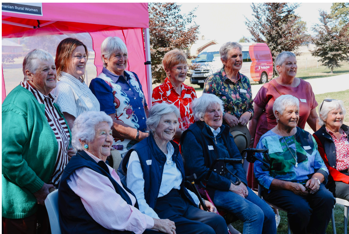
Photo of the 2026 Gathering Tasmanian Women in Agriculture Meander Valley Group.