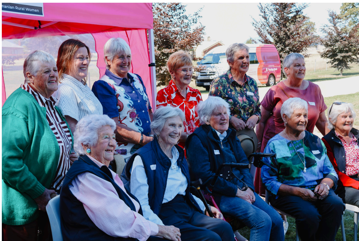
Founding Committee of Tasmanian Women in Agriculture.